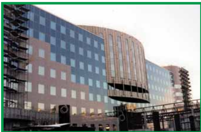
Central Bank - Moscow