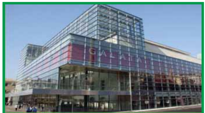
Sea Museum - Genua, Italy