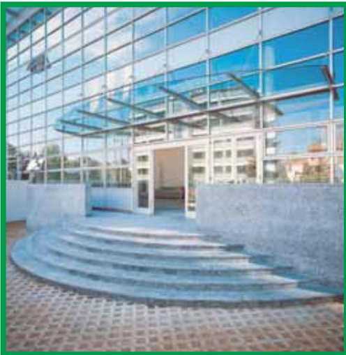
Audi Italia - Sesto San Giovanni (Milan), Italy