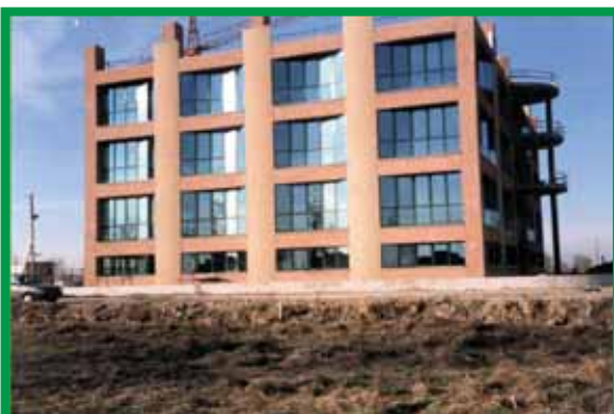
AEM - Cremona, Italy