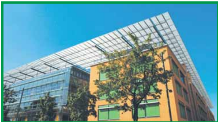
Il Sole 24 Ore - Milan, Italy