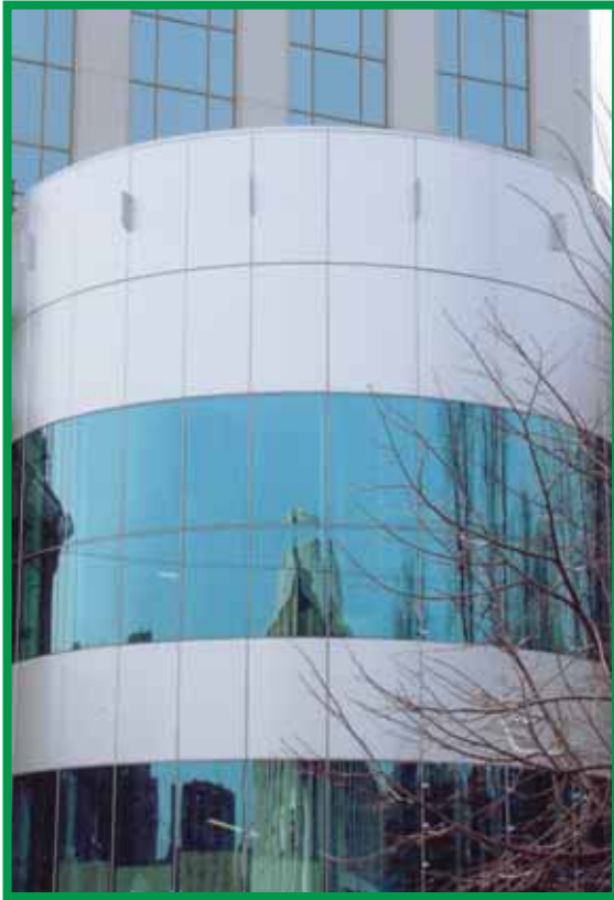
Nikkoil - Russia