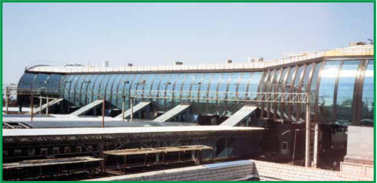
Railway tunnel Dome - Samara