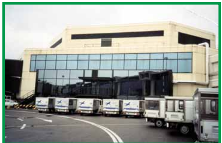
Malpensa 2000 - Milan, Italy