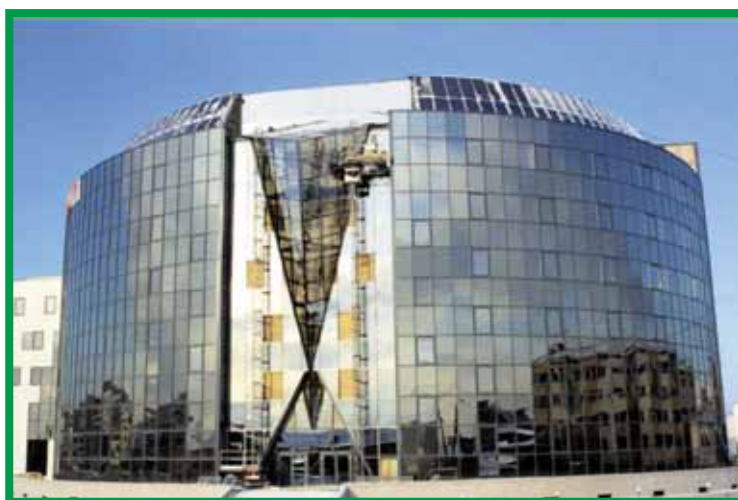
Iakutzia - Siberia