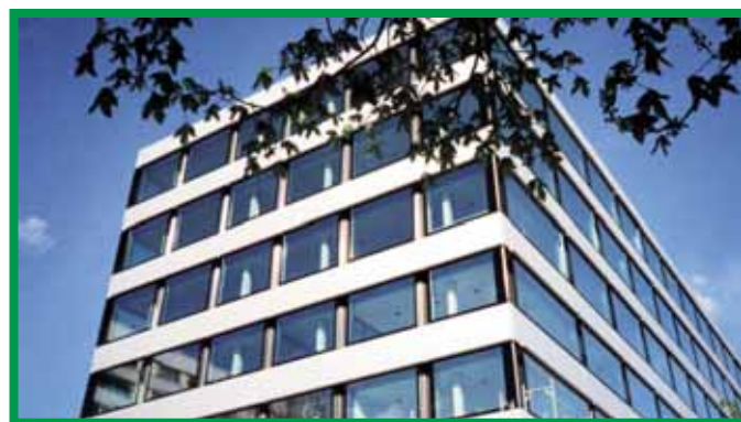
Golden Ring - Moscow