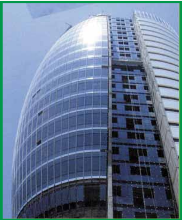
Egg - Israel