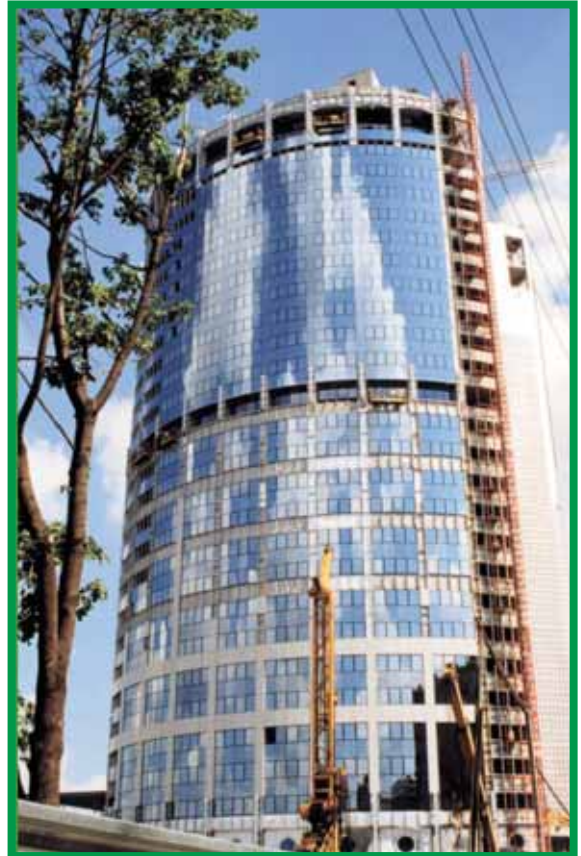
Reforma - Moscow